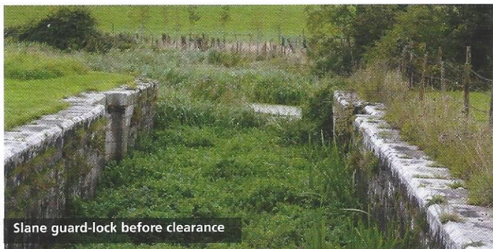
Slane guard-lock before clearance