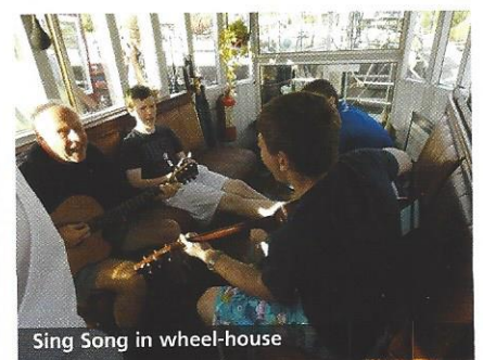
Sing Song in wheel-house