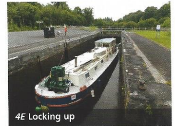
4E Locking up

The final total of craft participating reached the mid thirties with nearly twenty being in the older/larger category. A really remarkable event was witnessed by those involved and hopefully a