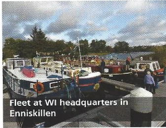
Fleet at WI headquarters in Enniskillen