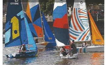
CityOne boats racing in Limerick