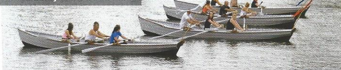
Gandelow racing in Limerick

The Dublin Steam Packet Company ran a steamer from Williamstown from 1835 and also operated a hotel on the site. The new plans for Williamstown include a coffee shop, chandlery, fuel supplies and workshop facilities. It is hoped the hire fleet will be reopened next spring. Boaters on Lough Derg will be fortunate to have 2 well run marinas so centrally positioned on the lake.