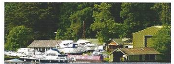
Williamstown Harbour under new management