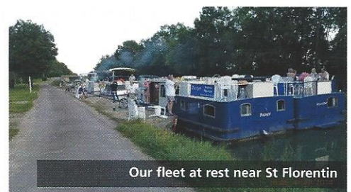
Our fleet at rest near St Florentin

Much discussion has taken place in and out of committee over the years as to the most suitable venue for this event. With the much improved premises of the Carrybridge Hotel it was decided that this would be a most