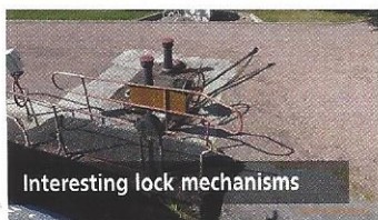
Interesting lock mechanisms

While the barges gave us adequate interior space, with each of the four bedrooms having full en suite facilities, and