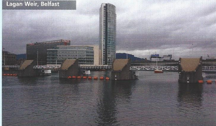
Lagan Weir, Belfast