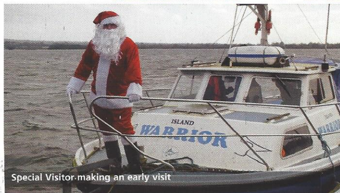
Special Visitor making an early visit