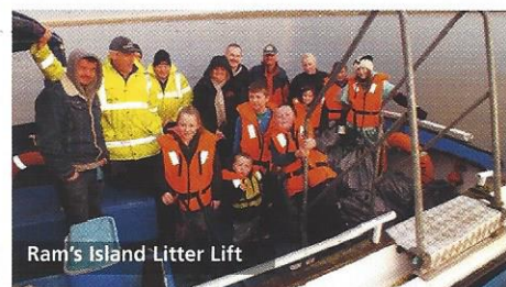
Ram's Island Litter Lift