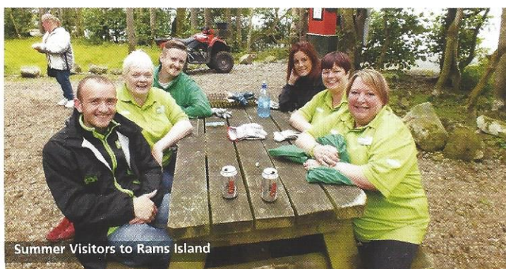
Summer Visitors to Rams Island