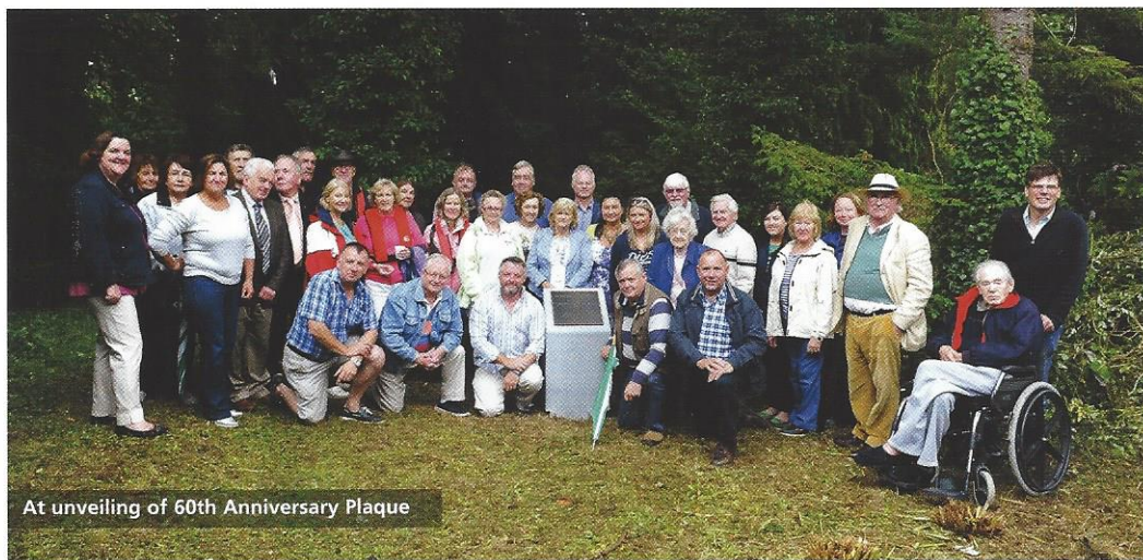
At unveiling of 60th Anniversary Plaque