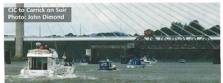
CIC to Carrick on Suir