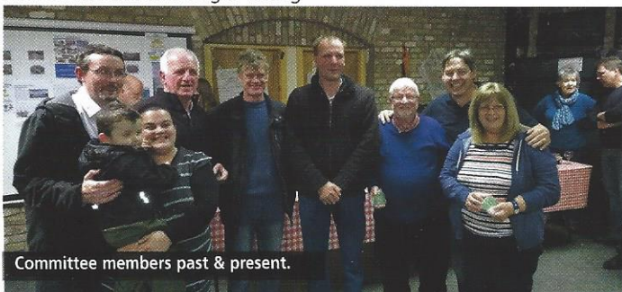
Committee members past & present.