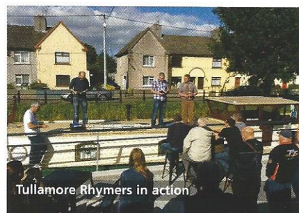
Tullamore Rhymers in action

The Tourism Ideas Forum was organised by Offaly Local