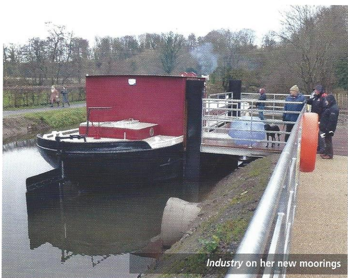
Industry on her new moorings