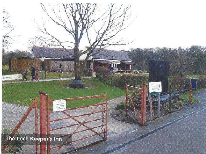
The Lock Keeper's Inn