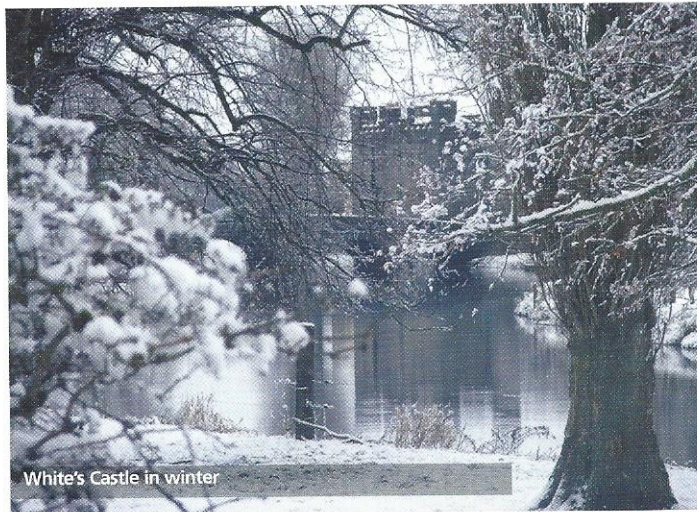
White's Castle in winter