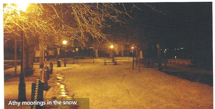
Athy moorings in the snow