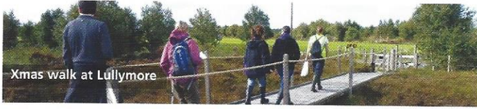
Xmas walk at Lullymore