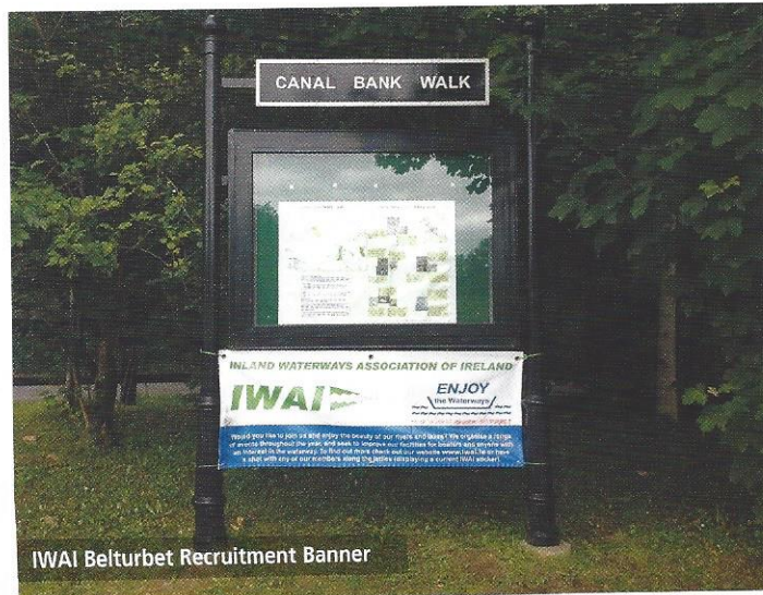
IWAI Belturbet Recruitment Banner