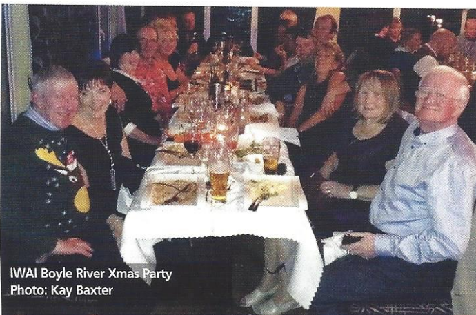
IWAI Boyle River Xmas Party