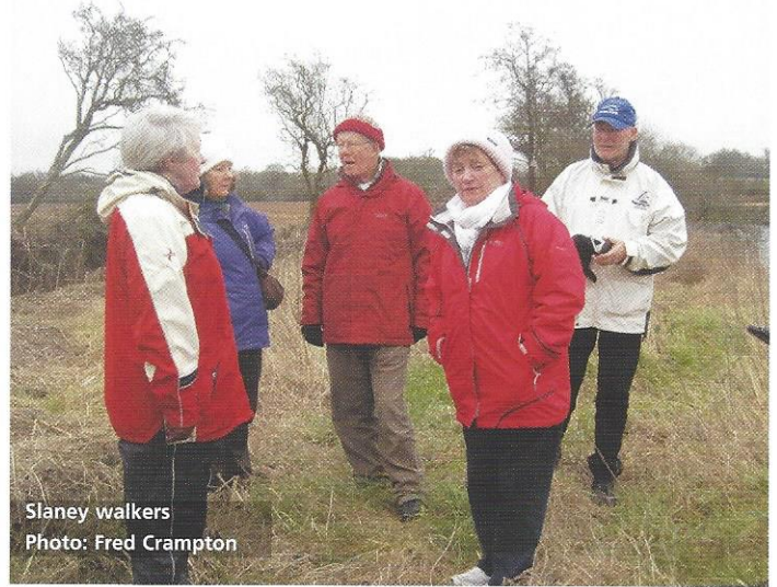
Slaney walkers

The 2014 AGM was held on 10 January 2015 – the 25th for the branch. There was a good attendance of 22 members and the Chairman was particularly delighted to welcome 6 new members who had joined during the year, adding a 'younger' dimension to the branch!! He reported on his first year as Chairman and how he had taken it on with a certain amount of trepidation as membership seemed to be dying; however he