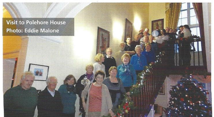
Visit to Polehore House