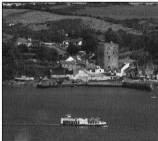
St Brendan off Ballyhack in the Suir Estuary